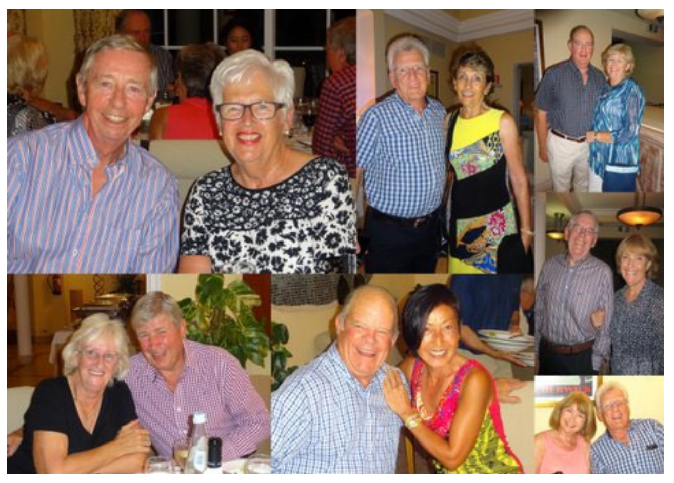
Wooden Spoon celebrations